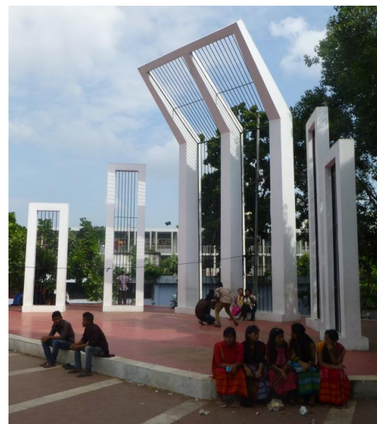
Shaheed Minar, "Martyr Monument", in Dhaka.